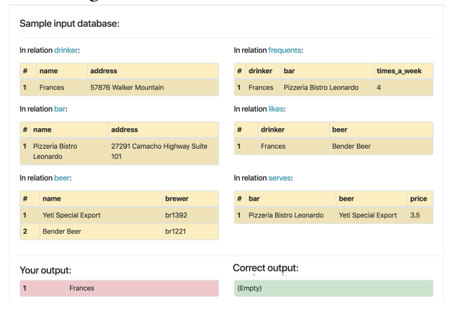
Figure 3: Counterexample for the query in Figure 2.

pick the overall smallest counterexample. However, computing provenance on all result tuples incurs high overhead. Instead, we can pick one tuple t in the difference, and compute provenance just for t , by adding a selection using t 's value on top of the difference query. Pushing this selection down as much as possible through the difference query drastically reduces the cost of provenance computation. Although this approach may not give us the smallest counterexample, it can always find a counterexample, and in practice it works well: it can reduce the running time significantly (up to 42× in our experiments) while still finding counterexamples that are almost as small as the smallest possible.